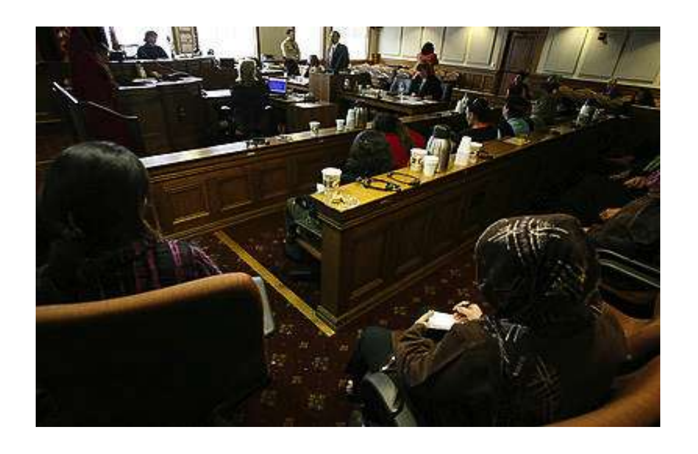
CHAPTER 3: CRIMINAL RESPONSIBILITY